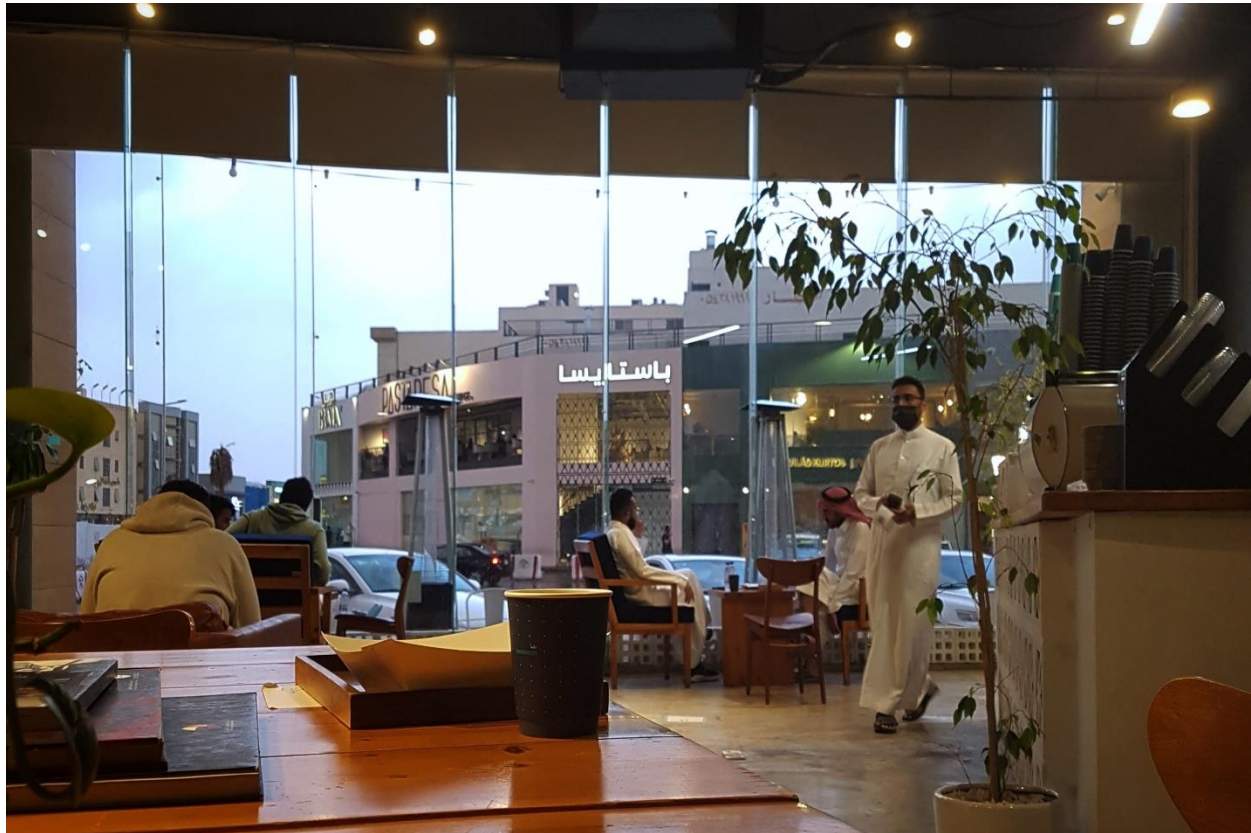
Fig. 3, Bash Coffee on Uthman ibn Affan Rd; One of the pioneer cafes in Buraidah, attracted 40 cafe restaurants and coffee shops to be neighbours in the vicinity in the last five years (source: author).